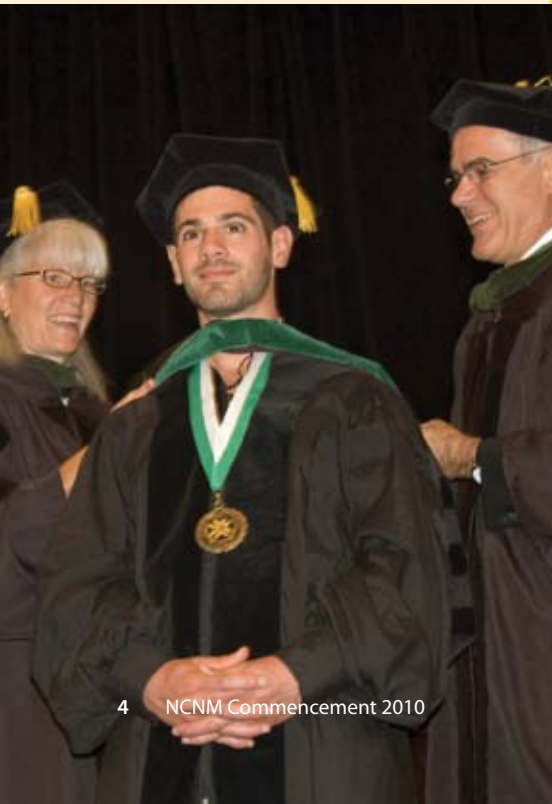
4 NCNM Commencement 2010

Hoods from the National College of Natural Medicine are green and white for all degree programs: Doctor of Naturopathic Medicine, Master of Science in Oriental Medicine and Master of Acupuncture. Dual-degree recipients wear the hood of the doctoral degree and a gold cord in recognition of their master’s degrees.